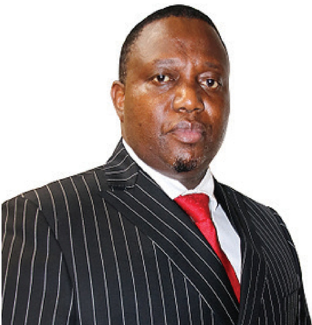
Hon. Minister Kazembe Kazembe

Through the Zimbabwe Republic Police the country has managed to maintain a peaceful environment throughout the campaign period for the 2023 general elections, before and after. There has also been a significant decrease in general crime compared to previous years.