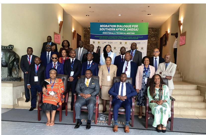
HON. KAZEMBE KAZEMBE WITH DELEGATES TO MDSA 2025