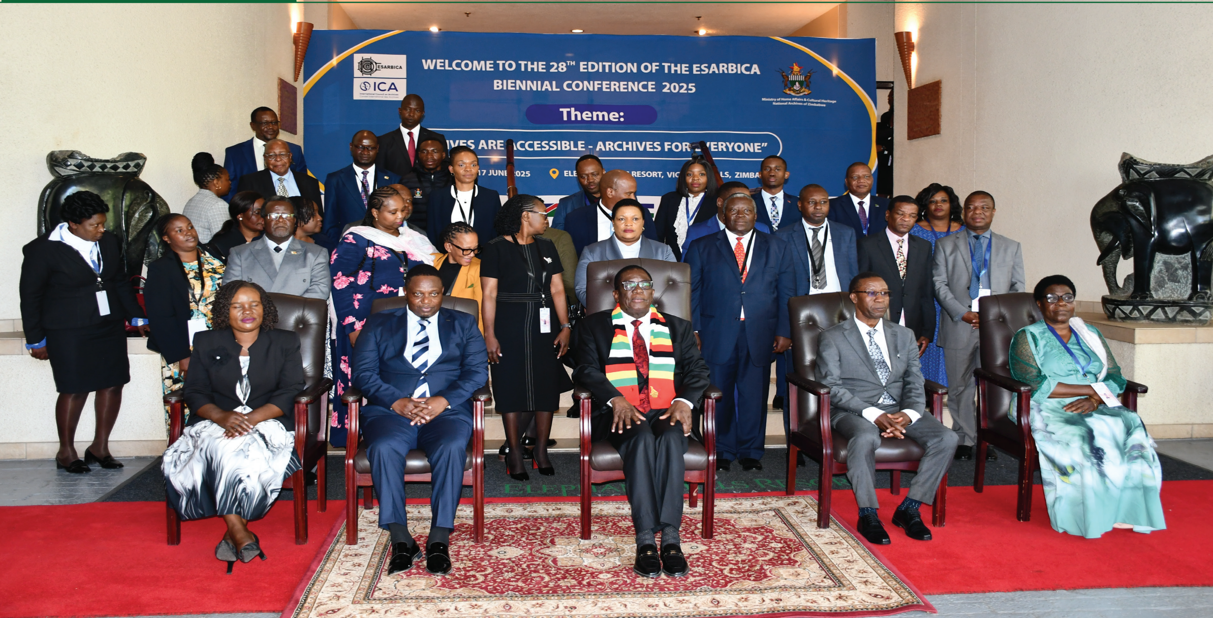
His Excellency, Dr. E. D. Mnangagwa with delegates to ESARBICA 2025