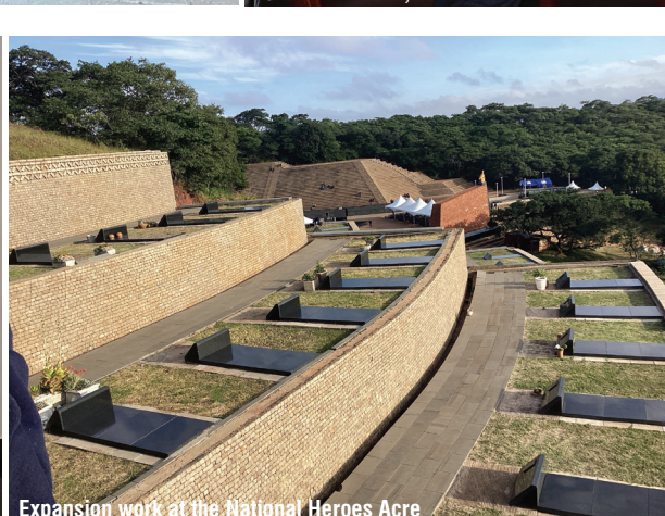
Expansion work at the National Heroes Acre