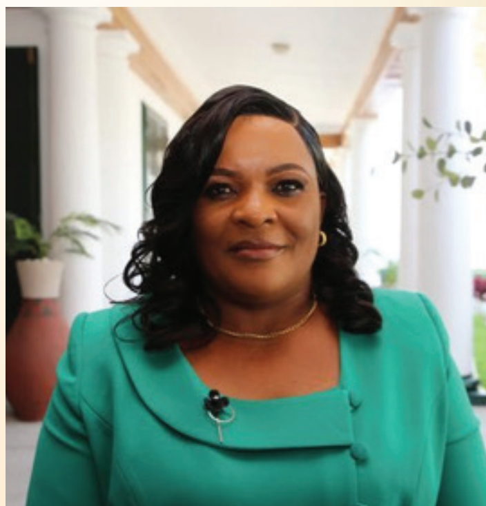
Hon. Deputy Minister Chido Sanyatwe