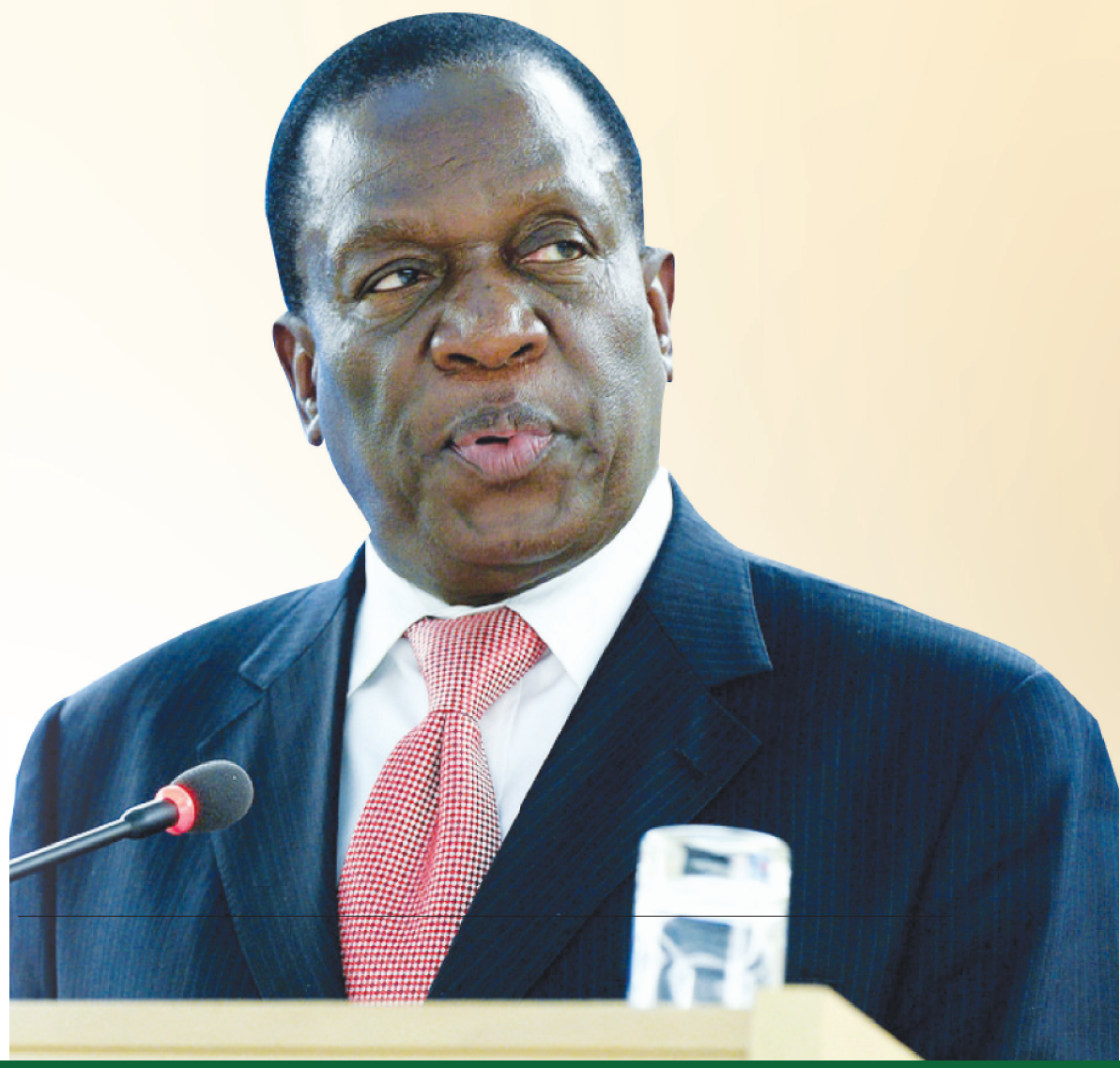
His Excellency, Dr. E. D. Mnangagwa

The Ministry of Home Affairs and Cultural Heritage is indebted to His Excellency, The President's wise leadership and people centric policies. We have upped the ante in the delivery of all the key performance areas in fulfillment of the Second Republic rallying point that of "Living noone and no place behind" . This is His Excellency's rallying point as we pursue His Vision of an Upper Middle Income Society By 2030.