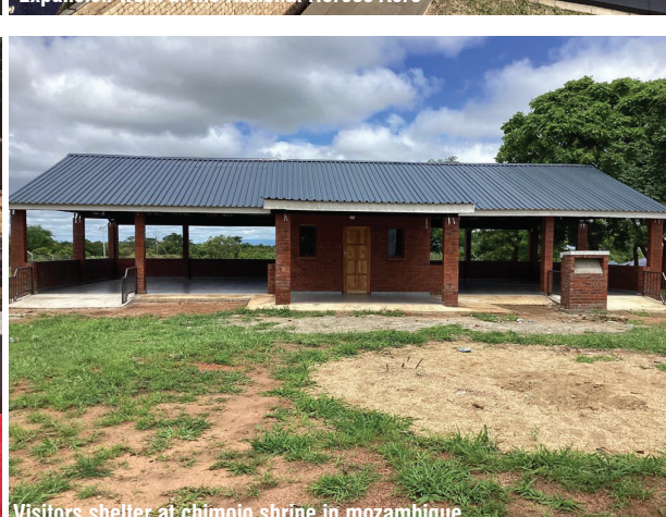
Visitors shelter at chimoio shrine in mozambique